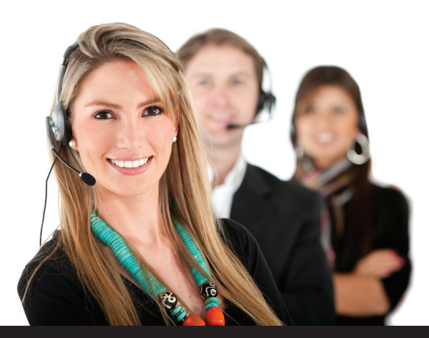
Providing Vehicle Owners with 24/7 Live Access to Information about Their Vehicle